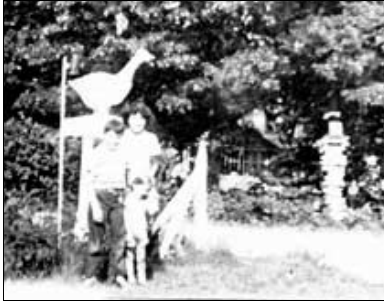
The editor, her brother, and a neighbor, 1952