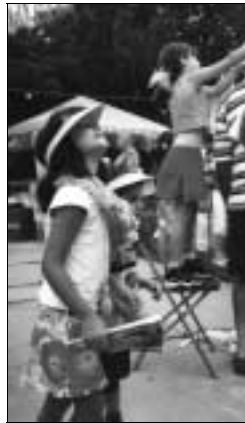
Mummy Wrap (FM)