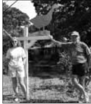
The editor and her brother 2002