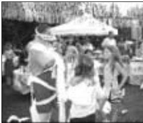
Mummy Wrap (GH)